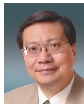
Professor the Hon. Anthony CHEUNG Bing-leung , GBS, JP Director Secretary for Transport and Housing