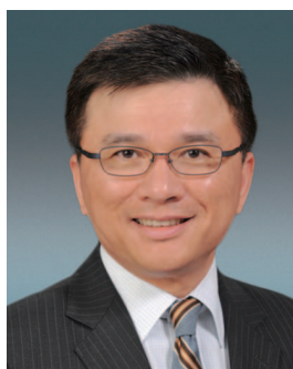
Professor the Hon. K C CHAN , GBS, JP Director Secretary for Financial Services and the Treasury