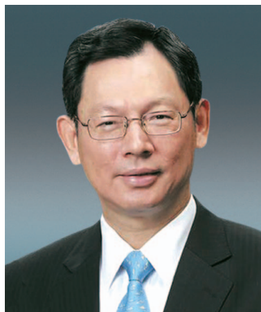
Mr Norman T. L. CHAN , GBS, JP Deputy Chairman and Executive Director Chief Executive Hong Kong Monetary Authority