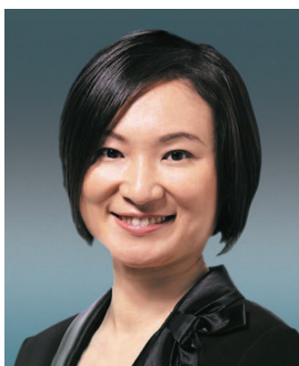
The Hon. Ms Starr Y LEE Wai-king , JP Director Member of Executive Council Member of Legislative Council