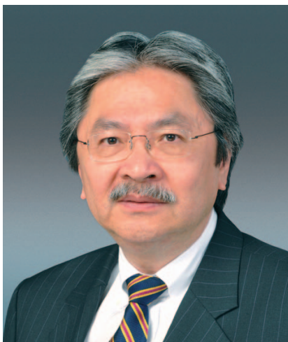
The Hon. John TSANG Chun-wah , GBM, JP Chairman and Executive Director Financial Secretary