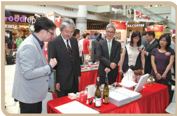
Microfinance Scheme Fair