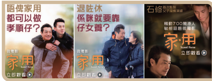
"Sweet Home" Microfilm Premiere