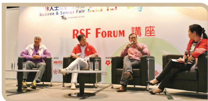
"Retiree and Senior Fair 2015" Forum with Wing Lung Bank