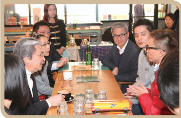
Gathering with Microfinance Scheme Borrowers