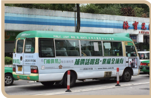
Poster and minibus body advertisement