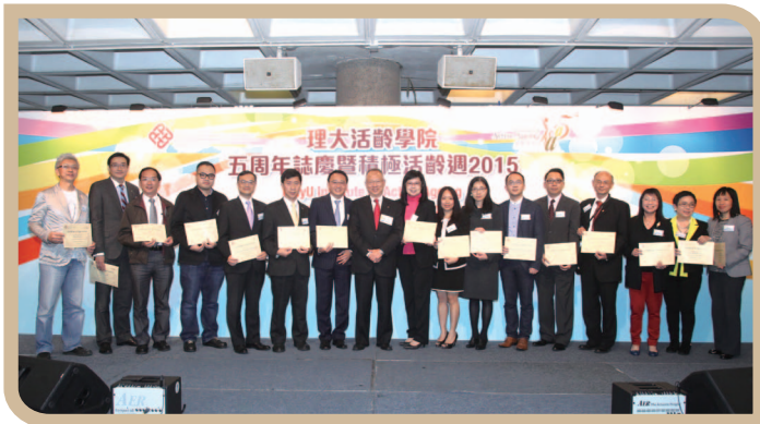
"Active Ageing Week 2015" organised by Institute of Active Ageing