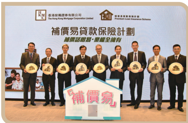
Launch of Premium Loan Insurance Scheme