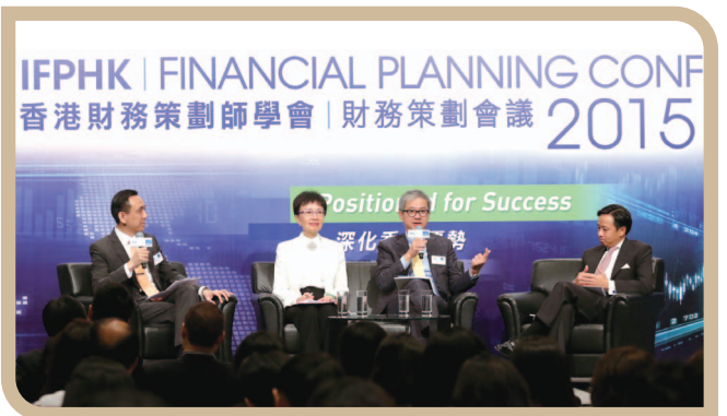
Discussion Panel on Retirement Planning - "The IFPHK Financial Planning Conference 2015"