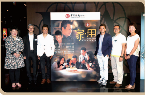
Microfilm Screening Event of "Sweet Home" with Bank of China (Hong Kong)