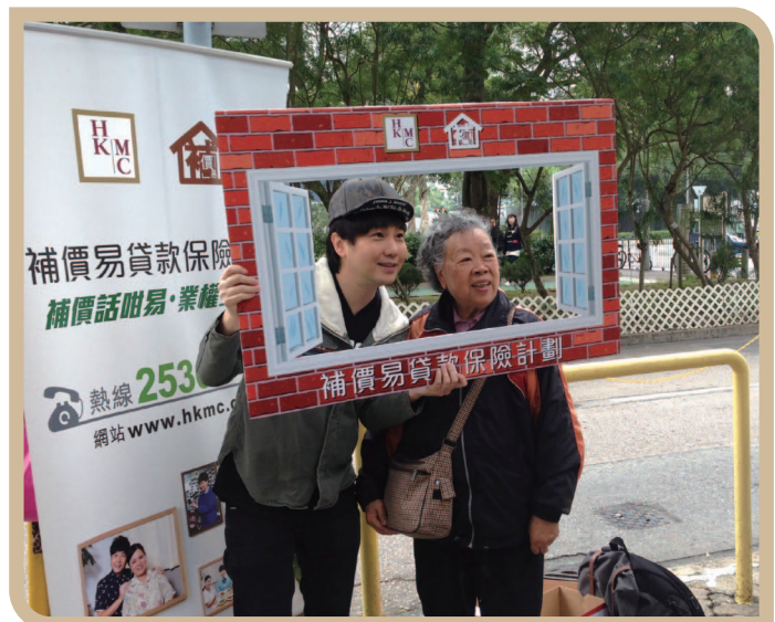
Outdoor promotional activities